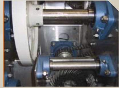
> Reliable rugged and easy to understand mechanics ensure reliable operation

in units of 2, while manual packers come in units of 4. The maximum machine configuration fits 12 outputs, for instance 8 automatic lanes (4 units of 2) and 4 manual lanes (1 unit of 4). The automatic packing lanes offer room for third party equipment such as labelling. For all possible combinations please see table.