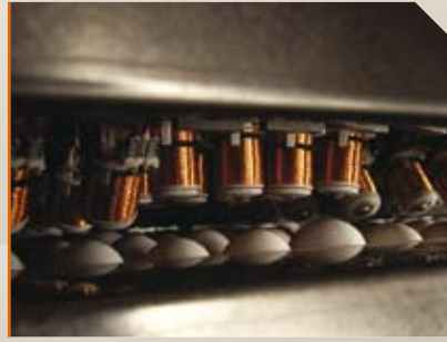
> Optional: Crack detection