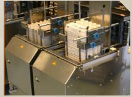
> Optional: Denesters