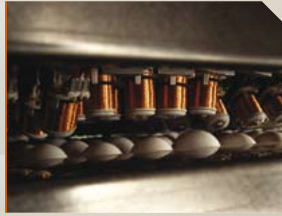
> Optional: Crack detection