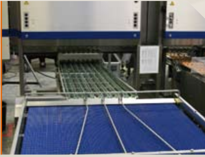
> Optional: Handpacking lane