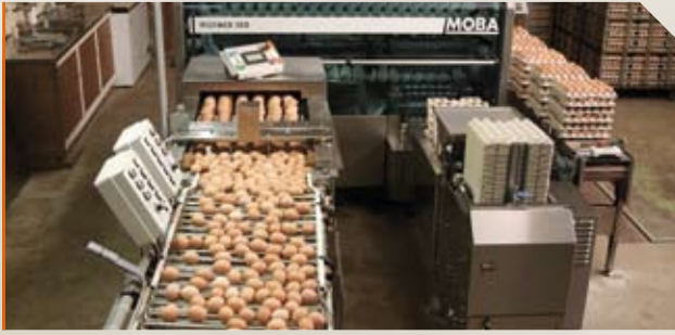
> A complete process overview from your working position