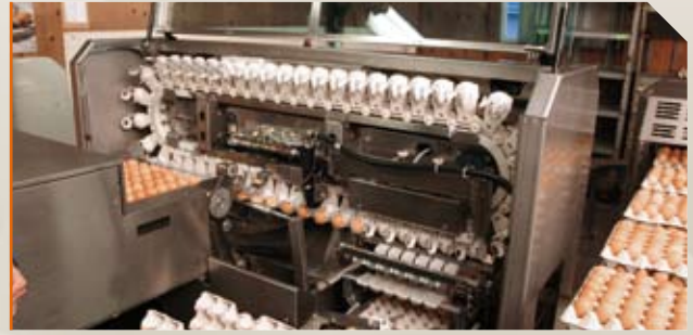
> All technology accessible by opening one cover