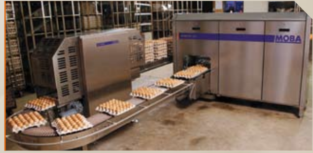
> Versatile conveying systems to adapt to your needs, with a minimum of supporting legs on the floor

has a vertical track system. This high tech track system has some strict advantages: