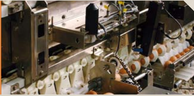
> Perfect inkjet possibilities on top of eggs